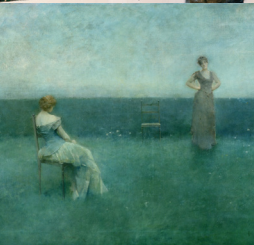
5 Ecorse Public Library 4184 W Jefferson Ave The Recitation , Thomas Dewing