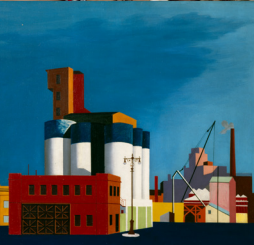
2 Ecorse City Hall - Front Entrance 3869 W Jefferson Ave Waterfront , J. Francis Criss