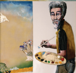
4 Ethel V. Stevenson Senior & Recreation Center 4072 W Jefferson Ave Portrait of a Collagist , Benny Andrews