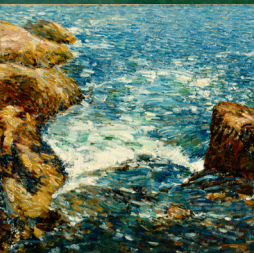
6 Dingell Park Corner of Southfield Rd and W Jefferson Ave Surf and Rocks , Childe Hassam