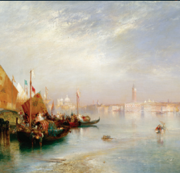
3 Ecorse City Hall - Back Entrance 3869 W Jefferson Ave The Fisherman's Wedding Party , Thomas Moran